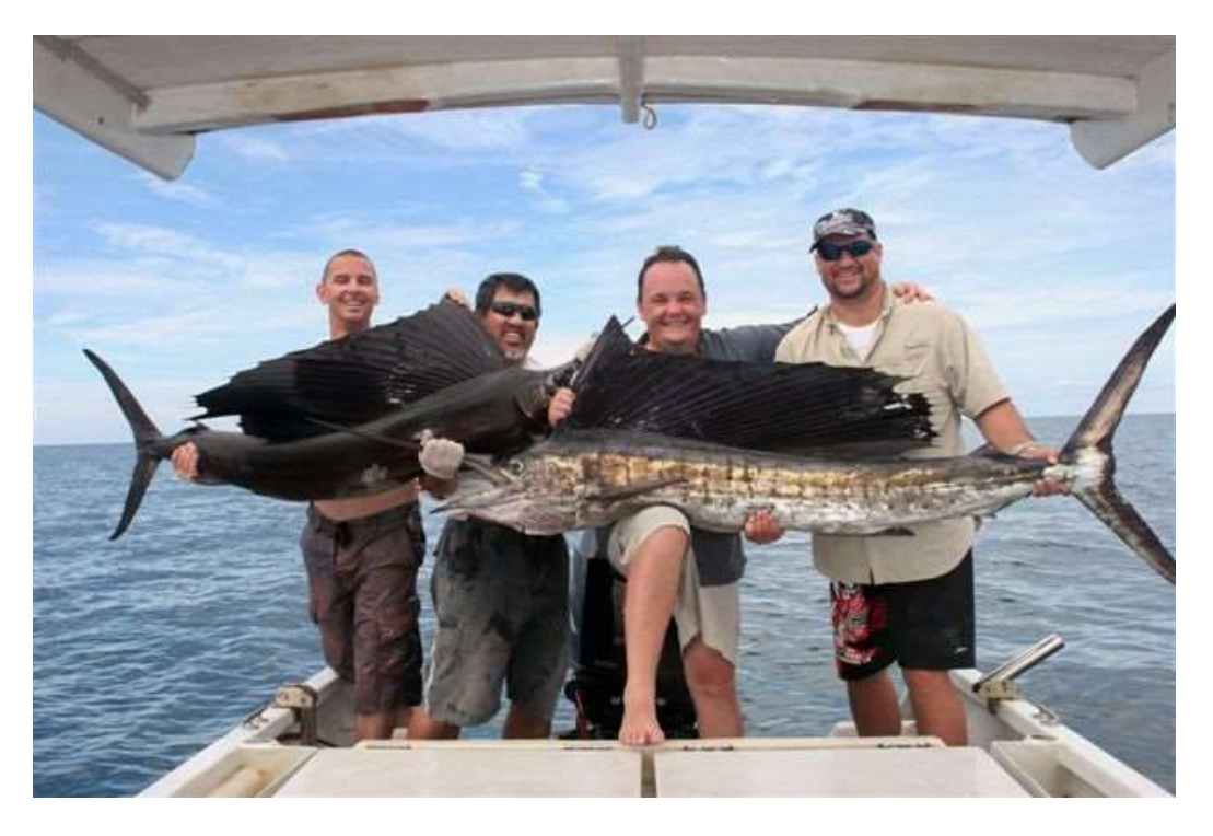
The 1<sup>st</sup> day, we managed to land 5 sails, and on Sunday 6 sails and the best was on Monday where our single boat landed 7 sails. The visitors were amazed with the sailfish, the numbers and the sizes and the action..

They have fished all over the world, from Abu Dhabi, Africa, to Australia and they have never seen so much action. Booking were immediately made and they will all be back this October and definitely bringing their friends in 2011.