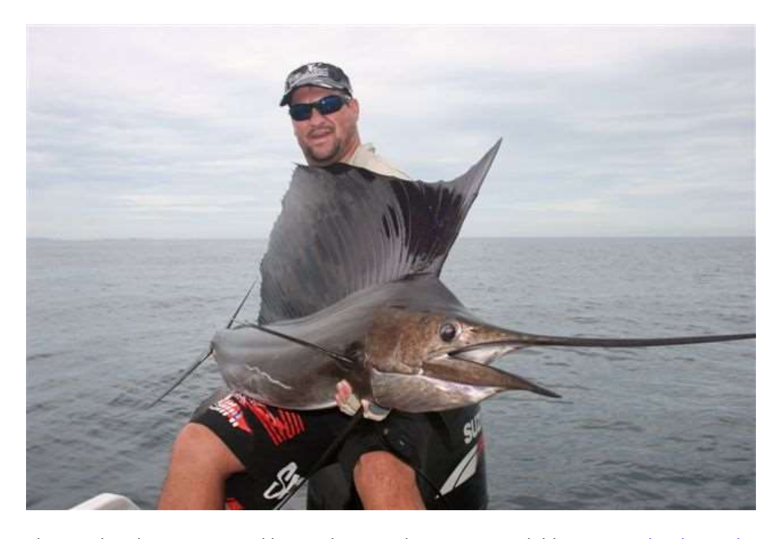
This weekend was organised by Hook on C Adventures, available on <a href="www.hookoncadventures.com">www.hookoncadventures.com</a>

They have fished all over the world, from Abu Dhabi, Africa, to Australia and they have never seen so much action. Booking were immediately made and they will all be back this October and definitely bringing their friends in 2011.