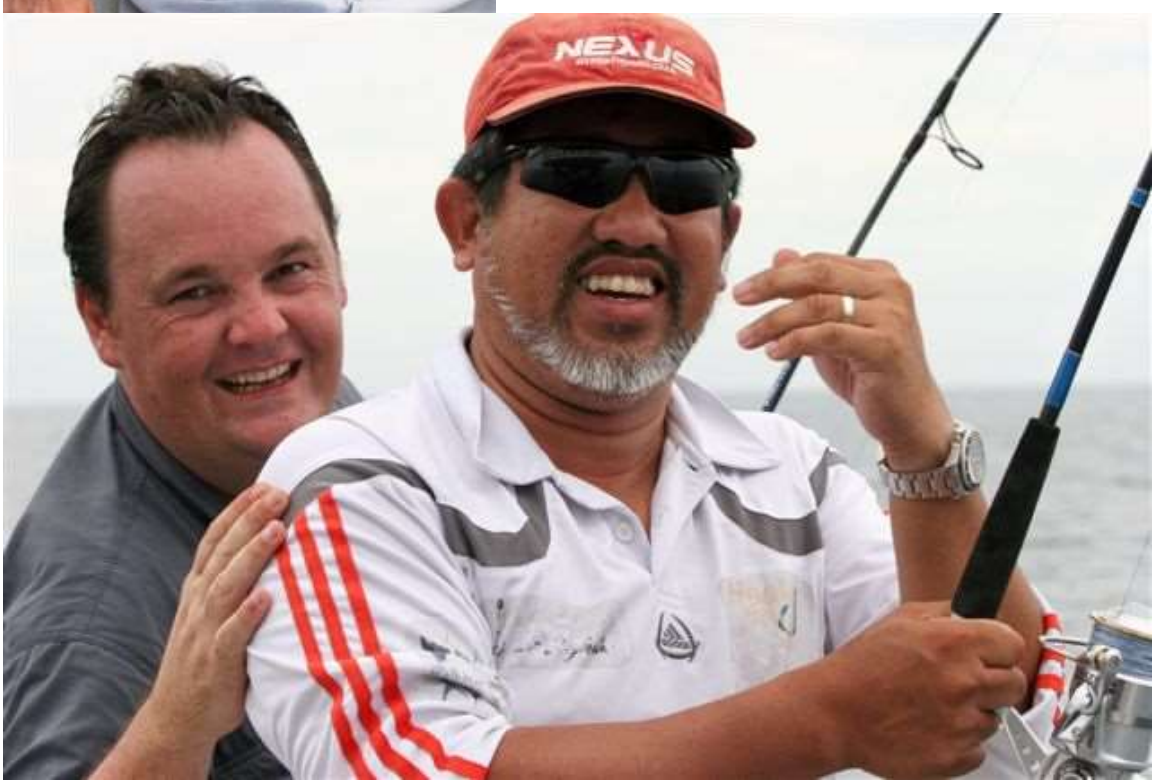
The morning of the 17^{\rm th} turn out lovely, cloudy with only a stiff 10 knot breeze...

We had 3 boats for the weekend, with 13 fishing. Captains rushed to get the boats ready while we had a leisurely breakfast basking in the morning sun. Action started at 9am, fishing for bait, tambans, selars were plenty