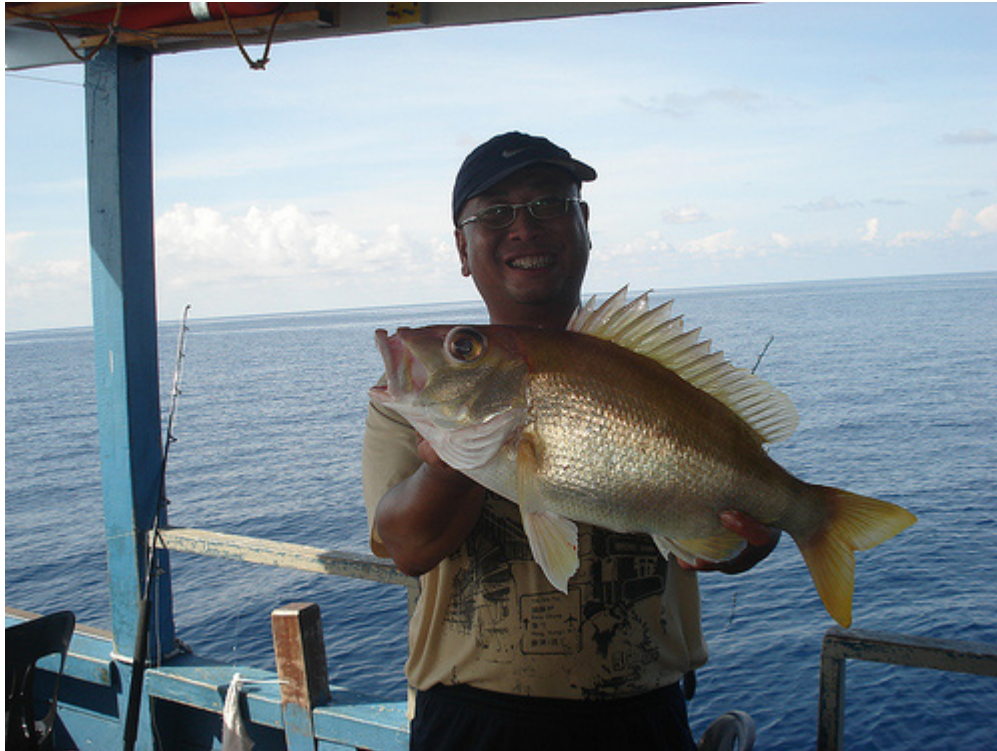
this one slightly different, it got a croaker's mouth