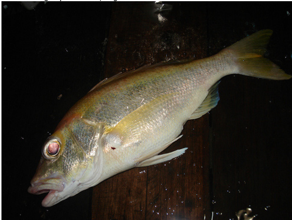
this one got a dorado's head. 🤪