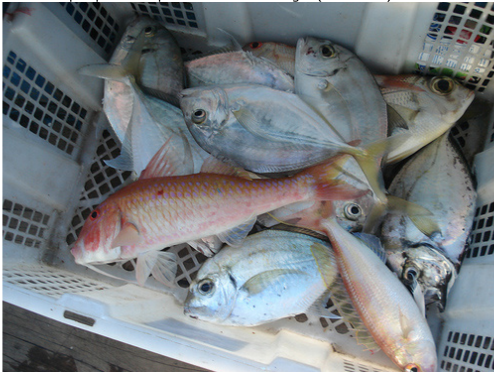
a rare goat fish, and plenty of fresh bait 🐟